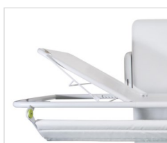
With optional tilting head/backrest

The Nivano 2 can be tailored for you with the addition of optional extras adding comfort, convenience and unique customisation.