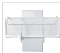
Stows neatly against the unit when not in use