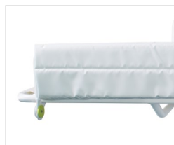
Optional guard with padded bumper