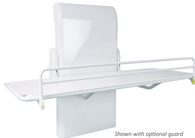
Shown with optional guard

However, the new improved Nivano 2 adjustable shower/changing bench offers even more benefits. It is simple to operate from a handset control and comes in a range of sizes from 1000mm right up to 1900mm to suit both paediatric and adult applications. This gives the widest choice of stretcher lengths on the market today - at no extra cost.